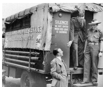
9AT KURE JAPAN