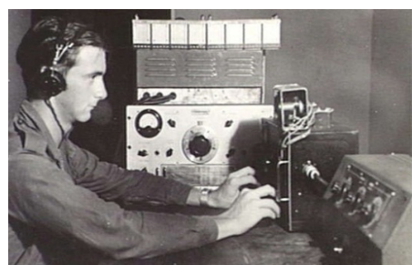
9AE CONTROL ROOM